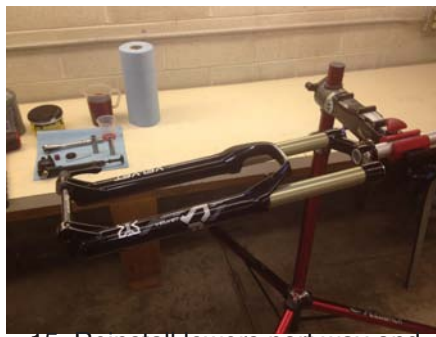
15. Reinstall lowers part way and flip vertically.