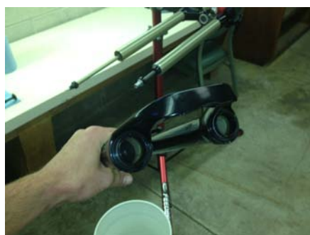
6. Remove lower and let drain.