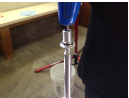
9. Remove footnut with 6mm allen wrench.