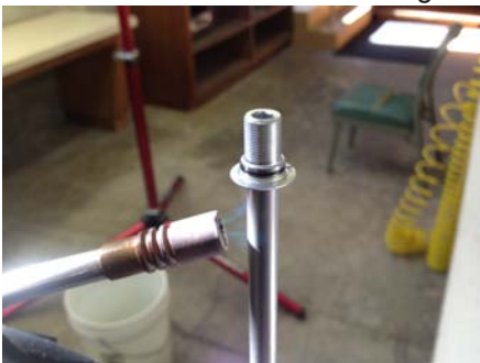
8. Clamp in vice with 9mm shaft clamps then put heat to shaft below footnut.