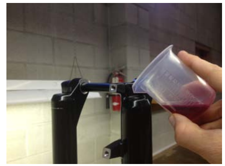
16. Add 15cc's of 7.5 Wt. suspension fluid to both sides of the lower leg.