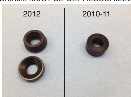
10. Make sure to use the correct spacer kit for your model year.