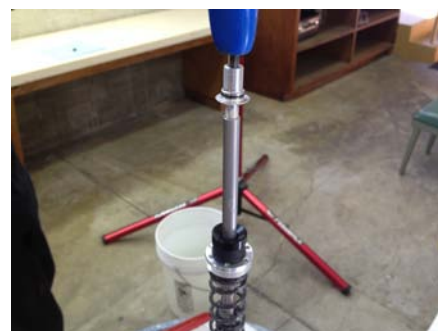
11. Install spacer kit on air rod and reinstall footnut.