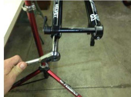
4. Use 11mm and 12mm to remove footnuts 50% of their threads.