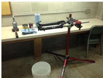
1. Mount in stand horizontally