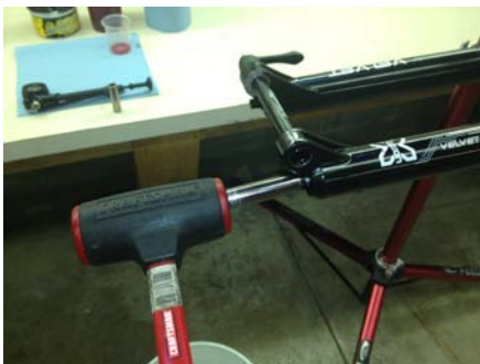
5. Use softblow to break seal between footnut and lower leg.