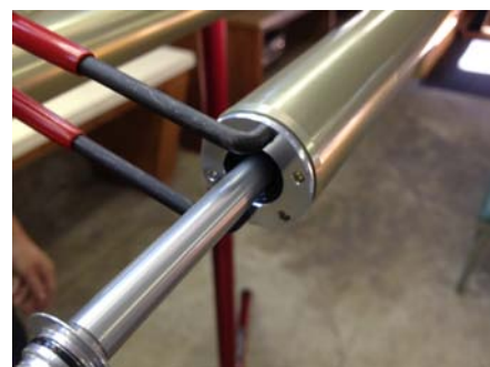
7. Remove baseplate with red spanner wrench. MUST BE DEPRESSURIZED!