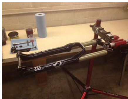
15. Reinstall lowers part way and flip vertically.