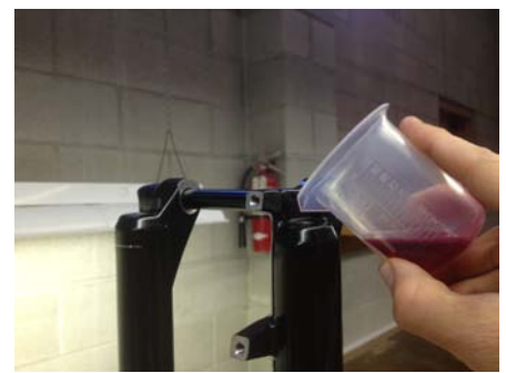
16. Add 15cc's of 7.5 Wt. suspension fluid to both sides of the lower leg.