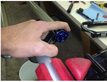
14. Lock fork out before reinstall.