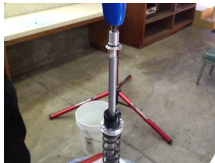
11. Install spacer kit on air rod and reinstall footnut.