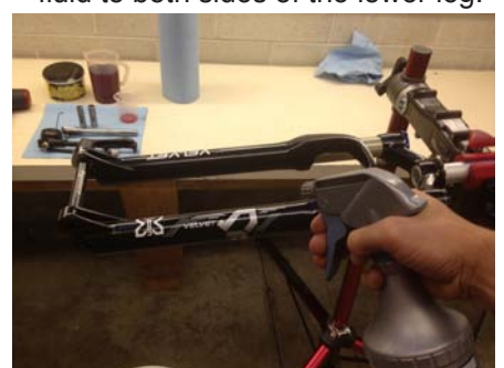
19. Clean with alcohol and clean towel/rag. Then reinstall on bike and go shred!