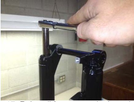
17. Reinstall footnuts and rebound knob.