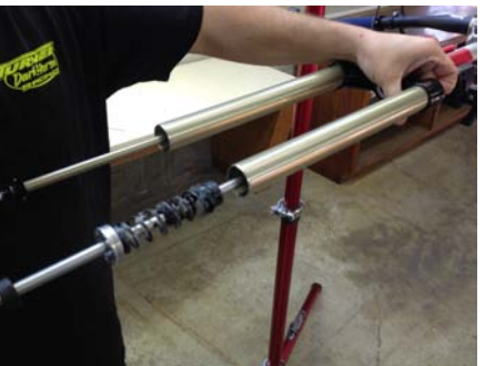
12. Reinstall air spring system.