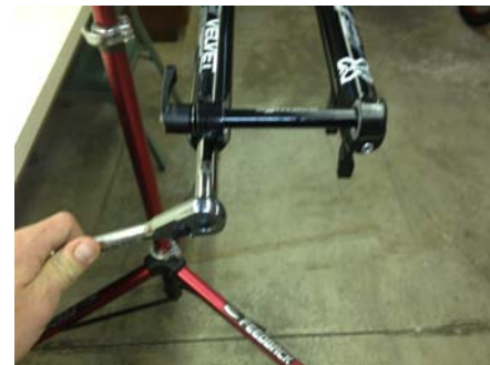
4. Use 11mm and 12mm to remove footnuts 50% of their threads.