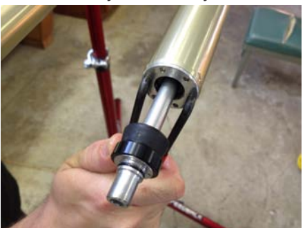
13. Reinstall baseplate.