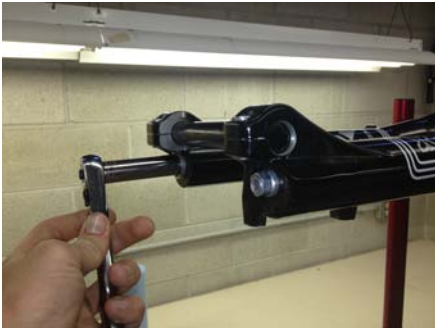
4. Remove footnuts 50% of their threads with 13mm.