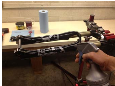
17. Clean with alcohol and clean towel/rag. Install on bike and SHRED!