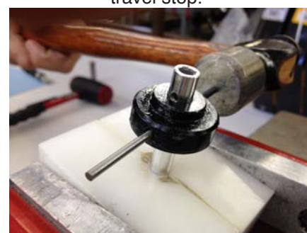
11. Move travel stop 10mm to desired travel setting. 160 or 170 Then tap push-pin back into rod.