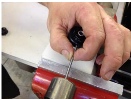
10. Line up your punch and tap the push-pin through the travel stop just far enough so that the stop can move freely.