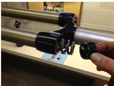
7. Remove top cap and spring perch.