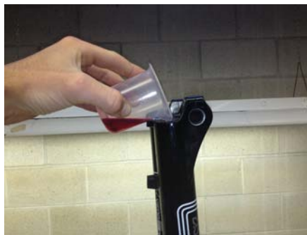
14. Add 20cc's of 7.5 weight fluid to both sides of the lower leg.