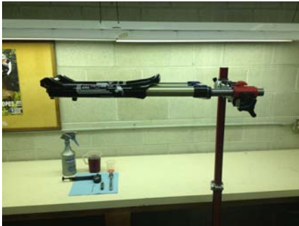
1. Mount in stand horizontally