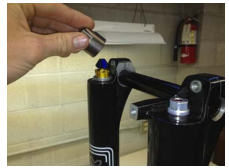
15. Reinstall footnuts and compression knobs.