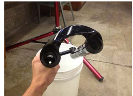
6. Remove lowers and let fluid drain.