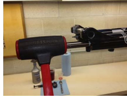
5. Use socket and softblow to break seal between footnut and lower leg.