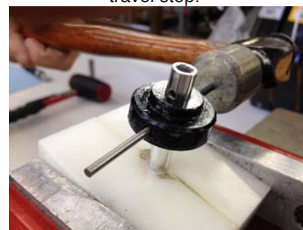
11. Move travel stop 10mm to desired travel setting. 160 or 170 Then tap push-pin back into rod.