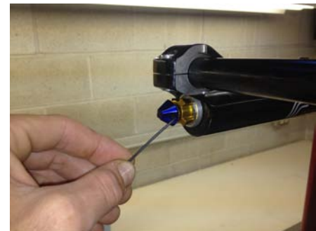
3. Remove compression knobs with 1.5mm