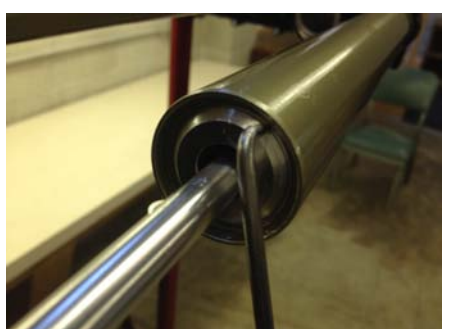
12. Reinstall rod and C-clip. Make sure C-clip is 100% seated in the groove.