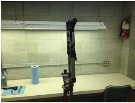
13. Reinstall lowers leaving an opening at bottom of leg then flip vertically.