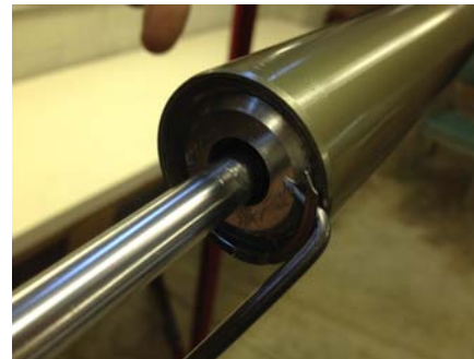
8. Remove C-clip to remove rod and travel stop.